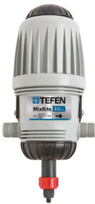
MixRite 2.5 Fixed