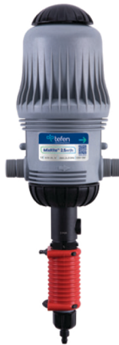
MixRite 2.5 Adjustable